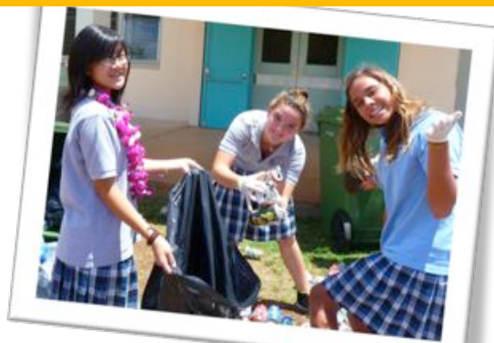
Council members already hard at work, recycling cans and bottles from the school cafeteria.